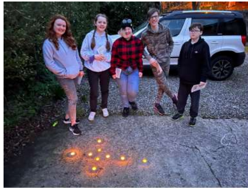
Group photo after evening prayer outside

Sunday Morning was an earlier start for the leaders as Pastries, Bacon, potatoes scones, and eggs were made in the kitchen for breakfast while the young people tidied up their sleeping bags and reset the room that they had been sleeping in on the floor.