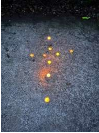
Candles on the stone drive for Evening Prayer

Saturday's main activities finished with Evening Prayer outside gathered around lit candles placed in the shape of a cross which included the Easter Sunday Gospel reading read out by different voices around the semi-circle.