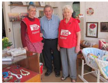
Photos from various lay ministry events at the East Perthshire charges. Clockwise from top left: Café Church, Messy Church artwork Harvest celebration in care home, Christian Aid Shop workers